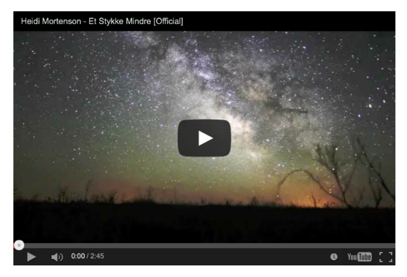
watch the video here